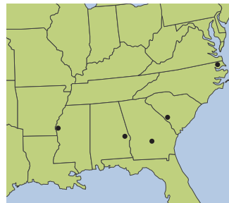
LOCATIONS: 5 trials across regions of the U.S. (AL, GA, MS, NC, SC)