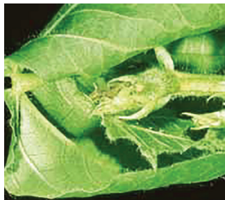
FIGURE A: Boron deficiency in cotton