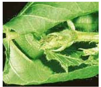
FIGURE A: Boron deficiency in cotton