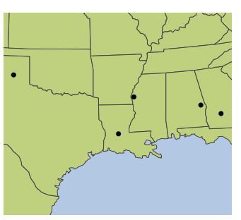
LOCATIONS: 6 trials across cotton growing regions of the U.S. (AL, GA, LA, MS, SC, TX)